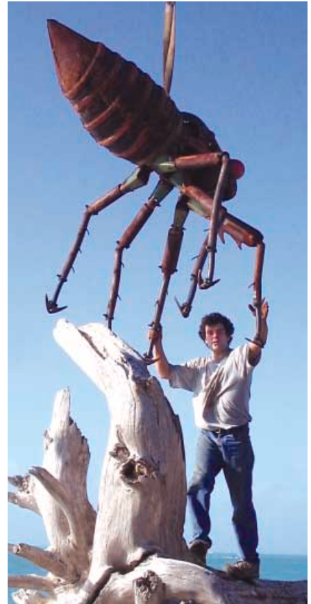
"Periodical Spaceship Cicada"