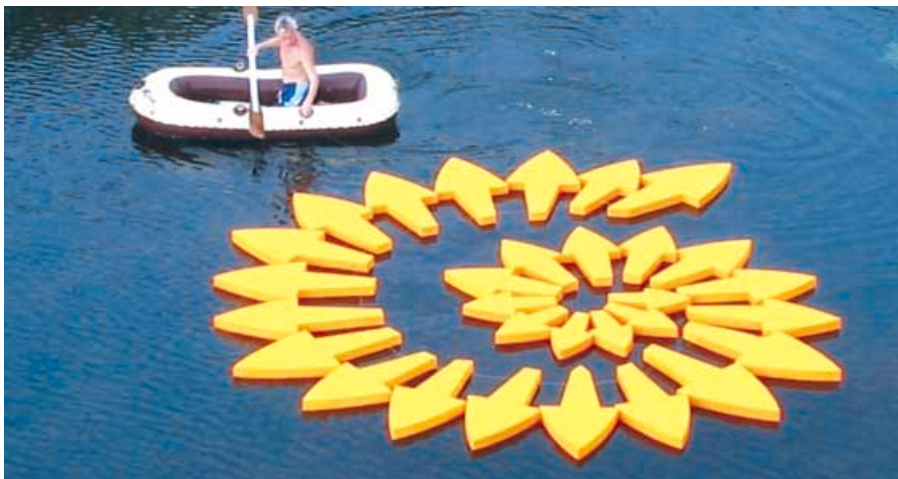
"The Spiral of Golden Arrows" photo credit: Sculpture Key West